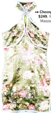
↔ Cheongsam, $249, from Mazzario