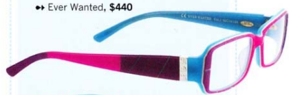
↔ Ever Wanted, $440

As an extension of Spring's rage for all things Oriental, consider a quirky pair of spectacles in fashionable neons and engraved with graphic dragons and the like. Produced by Italian company Area, the collection was inspired by its director's wife's Asian heritage – the frames are produced in limited quantities and are all hand-crafted with real silk, leaves and feathers. The 44 unique designs cost from $380-$520.