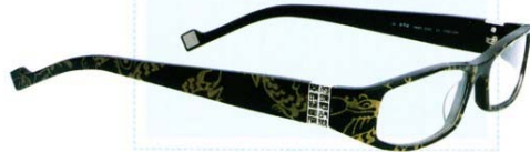
↓ Sweet Love, $400