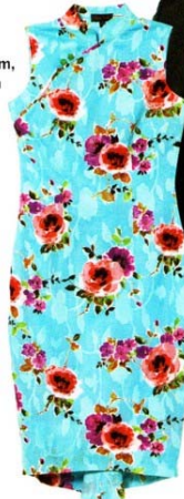
↑ Silk cheongsam, $359, from Tan Tan